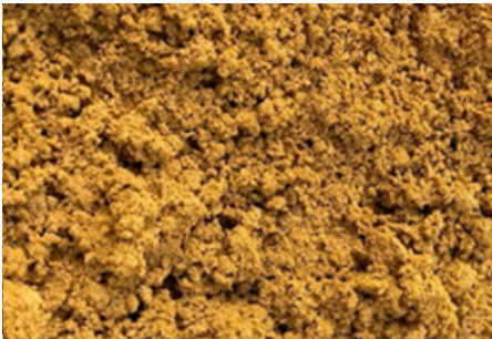
Yellow Brick Sand

A 5mm fine-grained sand commonly used by builders and landscapers for brick laying mortar and general construction work. Brick Sand provides reliable workability and binding qualities, making it a staple product for trade and DIY brick projects alike.