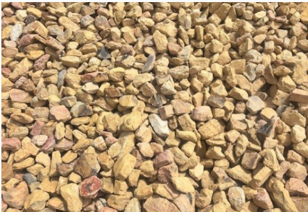
40mm Tuscan Screenings

A 20mm decorative screening, Tuscan Screenings are ideal for driveways and edges around pavers, topping garden beds for a neat, finished look, and landscape areas needing natural texture and colour., drains well.