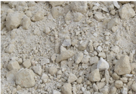
Type B Rock Fill

A naturally occurring, mechanically ripped rock product. Type A Structural Fill is widely used in road construction for embankments, bulk fill and load-bearing applications.