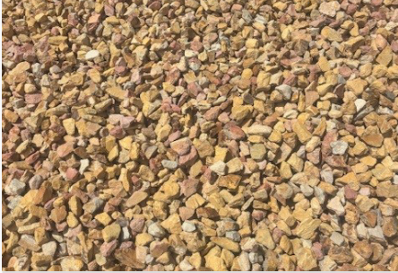
20mm Tuscan Screenings

Please note: product photos are indicative only. As all Langwarrin Quarries rock products are naturally sourced, slight variations in size, colour, contents and appearance are to be expected. We strongly recommend contacting our sales office for further product information to ensure the product is suitable for your intended purpose.