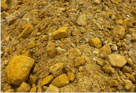
Type A Structural Fill

Please note: product photos are indicative only. As all Langwarrin Quarries rock products are naturally sourced, slight variations in size, colour, contents and appearance are to be expected. We strongly recommend contacting our sales office for further product information to ensure the product is suitable for your intended purpose.