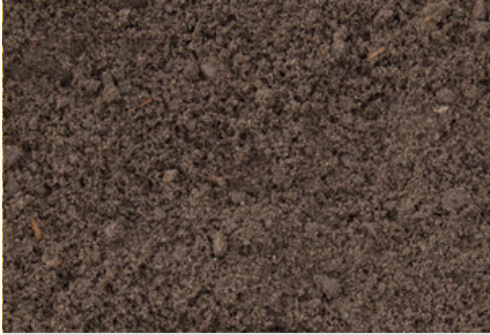
Top Garden Soil

Please note: product photos are indicative only. As all Langwarrin Quarries sand products are naturally sourced, slight variations in size, colour, contents and appearance are to be expected. We strongly recommend contacting our sales office for further product information to ensure the product is suitable for your intended purpose.