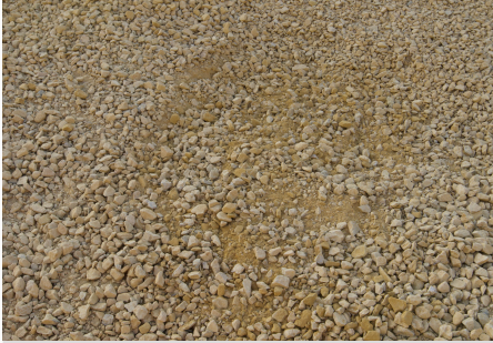
20mm Commercial Crushed Rock (NDCR)

Please note: product photos are indicative only. As all Langwarrin Quarries rock products are naturally sourced, slight variations in size, colour, contents and appearance are to be expected. We strongly recommend contacting our sales office for further product information to ensure the product is suitable for your intended purpose.