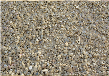
40mm Commercial Crushed Rock (NDCR)

A crushed and screened natural rock product graded to 20mm minus. Generally used under concrete pavements and across hardstand areas, this compacts firmly and binds tightly. Also known as 20mm NDCR.